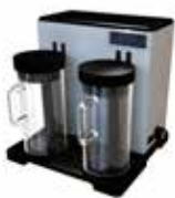
DI-110-A, KjelROC Scrubber

DI-211-A, KjelROC Digestor Auto 10 DI-220/221-A, KjelROC Digestor Auto 20 Our standard Digestion block with capacity for 10 or 20 tubes, one rack included and exhaust for DI-211/221-A