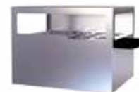
DI-010-A, Rack 10 DI-020-A, Rack 20