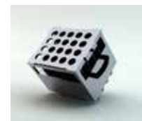
DI-052-A, Washing Lid 10 DI-053-A, Washing Lid 20

DI-211-A, KjelROC Digestor Auto 10 DI-220/221-A, KjelROC Digestor Auto 20 Our standard Digestion block with capacity for 10 or 20 tubes, one rack included and exhaust for DI-211/221-A