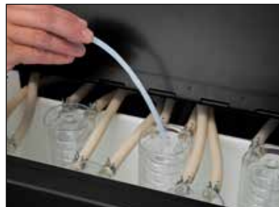
CLOSED ADDITION OF SOLVENTS