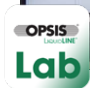
THE LabCONNECT SOFTWARE ALLOWS FOR EASY CONNECTIVITY TO YOUR LABORATORY