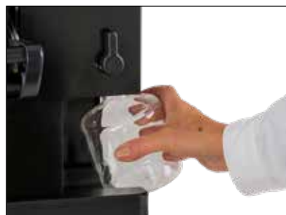
EASY TO REMOVE SOLVENTS