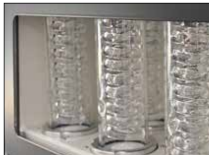
UNIQUE SEALING SYSTEM ACHIEVES MORE THAN 90% RECOVERY OF SOLVENTS, SAVING COSTS