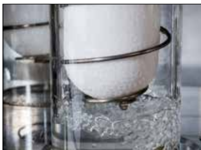
ALL HEATINGS IS MONITORED BY TWO SEPARATE TEMPERATURE SYSTEMS, MAKING THE SOXROC A VERY SAFE INSTRUMENT TO USE.