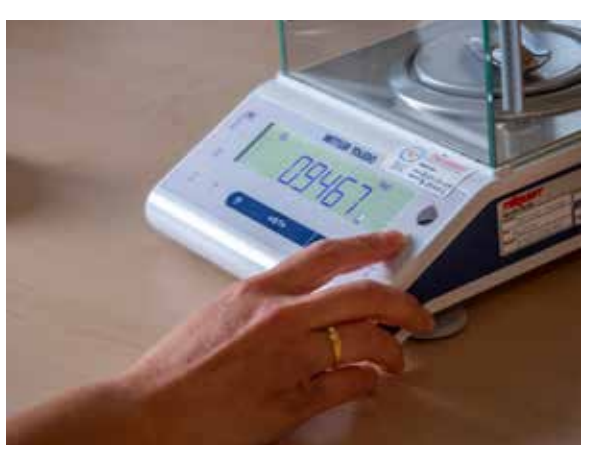
TRANSFER WEIGHTS FROM THE BALANCE TO LABCONNECT BY PRESSING A BUTTON, THIS WILL SAVE TIME.