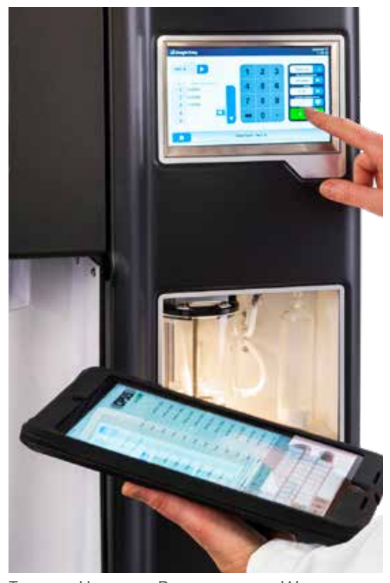
Transfer Utility on iPad to transfer Weights to the KjelROC Analyzer