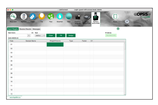
Get messages from all your connected OPSIS LiquidLINE Instruments