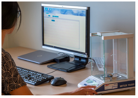
Connect your laboratory. Direct transfer of Weights from your balance.

Analyze all your Results with Statistical Tools % \left( {{\left[ {{{\rm{TOOLS}}} \right]}_{\rm{TOOLS}}} \right)