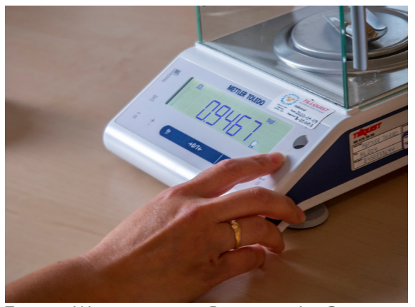
TRANSFER WEIGHTS FROM THE BALANCE TO LABCONNECT BY PRESSING A BUTTON. THIS WILL SAVE TIME.