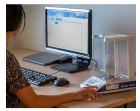
CONNECT A BALANCE TO LABCONNECT AND TRANSFER WEIGHTS FROM THE BALANCE INTO THE FIBERROC AUTO BATCH.