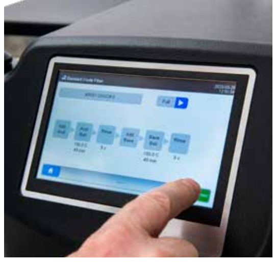
THE FIBERROC TOUCHSCREEN MAKES IT EASY TO SELECT AND PERFORM OPERATIONS. THE LEARNING CURVE IS LOW FOR ANYONE THAT IS USED TO THE OPSIS LIQUIDLINE KJELROC.

Same LabConnect software and similar User interface on several OPSIS LiquidLINE instruments simplifies laboratory work. Both LabConnect and the FiberROC Auto can be adjusted to existing Lab procedures.