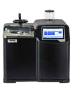
LOWER MAINTENANCE COSTS WITH OPSIS LIQUIDLINE BLACKLINE COATING.