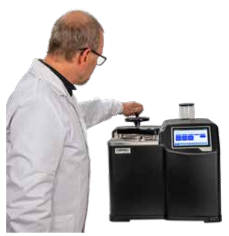
CLOSE THE TOP LIT AND LET YOUR FIBERROC AUTOMATICALLY HANDLE ALL STEPS WITH BOILING AND RINSING, SAVES VALUABLE OPERATOR TIME.