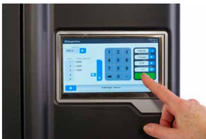
AN OVERVIEW OF THE WHOLE RACK WITHOUT POP-UP DIALOGUES - AN INSTRUMENT WITH THE USER IN MIND.