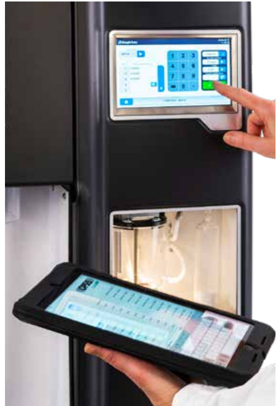
THE TRANSFER UTILITY (IPAD) AND THE LABCONNECT SOFTWARE ALLOWS FOR EASY CONNECTIVITY TO YOUR LABORATORY