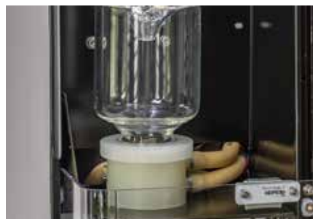
PROTECTION WITH BLACKLINE AS WELL AS PTFE COATING AROUND SENSITIVE PARTS. POLYPROPYLENE SPLASHHEAD OPTIONAL.

** OPSIS LiquidLINE BlackLINE coating is taken from latest development in Swedish corrosion technology. Similar coating is used in trucks and cars from Volvo and Scania.