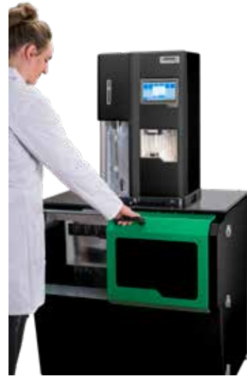
IT IS EASY TO INSERT A TUBE RACK INTO THE AUTOSAMPLER. A FRONT DOOR PROTECTS THE OPERATOR DURING OPERATION.