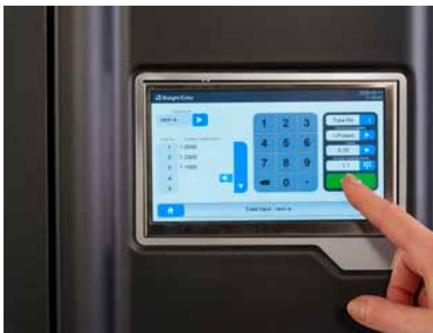
AN OVERVIEW OF THE WHOLE RACK WITHOUT POP-UP DIALOGUES - AN INSTRUMENT WITH THE USER IN MIND.