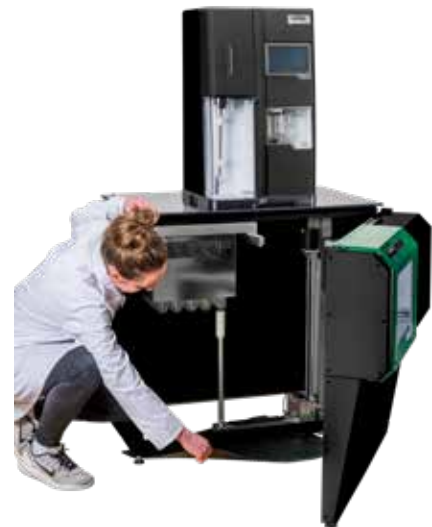
IT IS EASY TO OPEN AND CLEAN THE AUTOSAMPLER INSIDE.